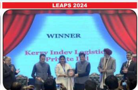
Core Logistics : Air Freight Service Provider