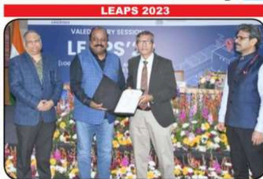
Core Logistics : Maritime Freight Service Provider

winner of the prestigious Logistics Excellence, Advancement, and Performance Shield (LEAPS 2024) Award for the category Core Logistics: Air Freight Service Provider on 3rd January 2025, presented at Bharat Man-