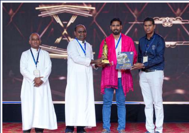
BUSINESS EXCELLENCE SHARATH KAMAL TABLE TENNIS PLAYER