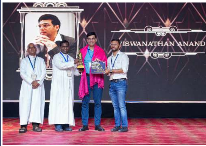
SPORTING EXCELLENCE VISWANATHAN ANAND WORLD CHESS CHAMPION